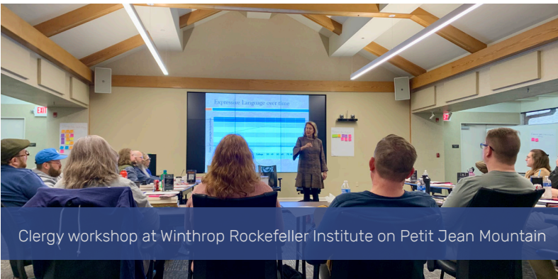
Clergy workshop at Winthrop Rockefeller Institute on Petit Jean Mountain