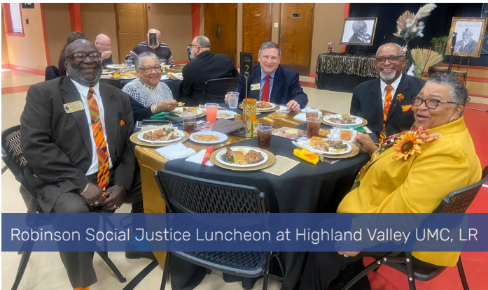
Robinson Social Justice Luncheon at Highland Valley UMC, LR