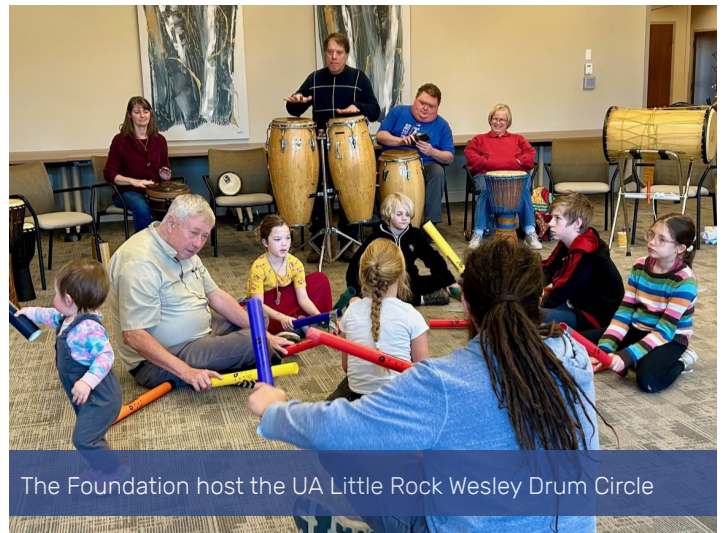
The Foundation host the UA Little Rock Wesley Drum Circle