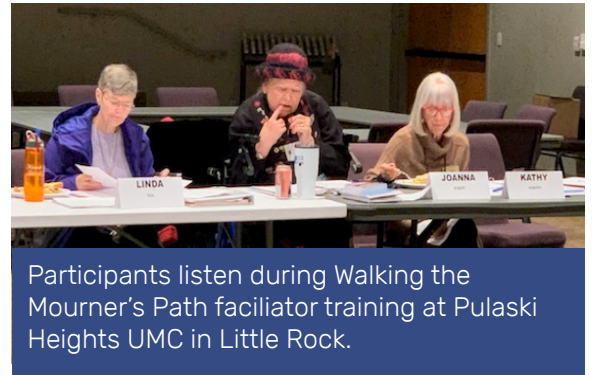
Participants listen during Walking the Mourner's Path facilitator training at Pulaski Heights UMC in Little Rock.

Pulaski Heights United Methodist Church in Little Rock received a $10,000 grant from the Foundation for statewide facilitator training of United Methodist clergy and laity in the Walking the Mourner's Path grief program. Nineteen United Methodist clergy and laity facilitators were trained.