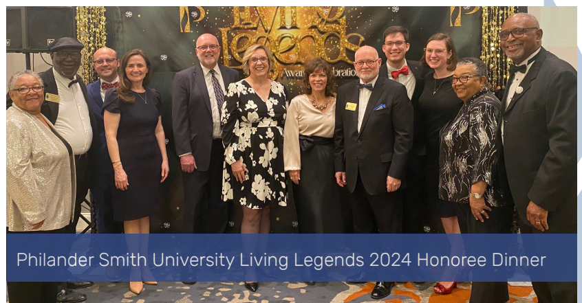
Philander Smith University Living Legends 2024 Honoree Dinner