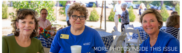
MORE PHOTOS INSIDE THIS ISSUE