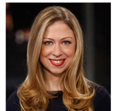
Thursday, June 17, 2021 Chelsea Clinton Author & Vice Chair, The Clinton Foundation